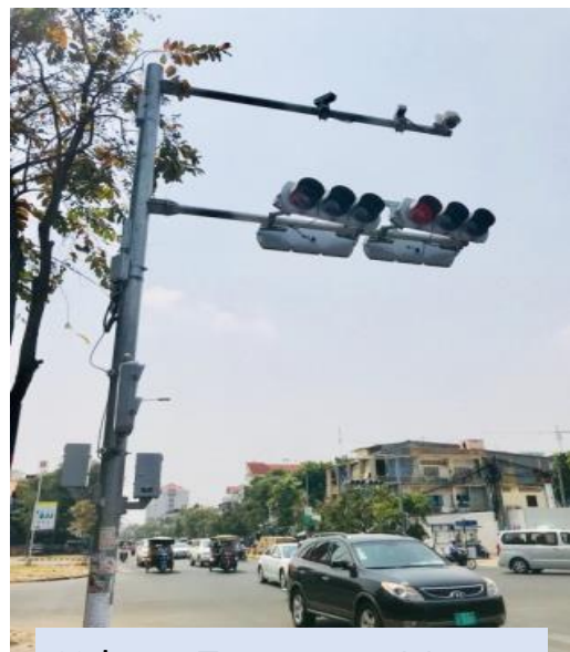
Urban Transport Master Plan in Phnom Penh